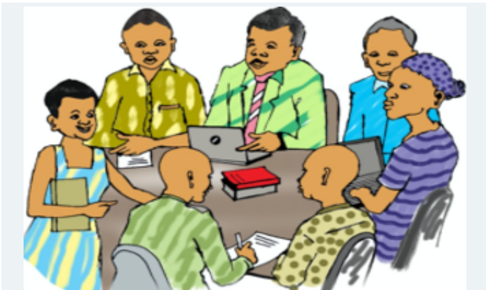
A law committee & local government technical committee identifying issues for legislation