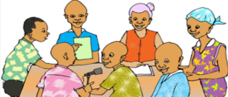
A law committee and local government technical committee examining the existing laws