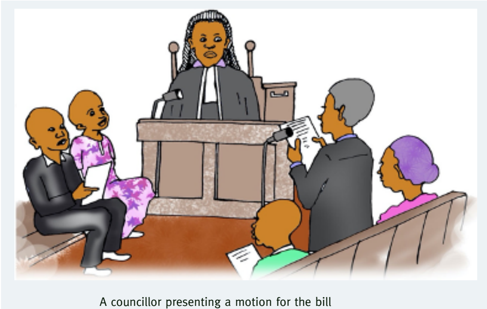
A councillor presenting a motion for the bill