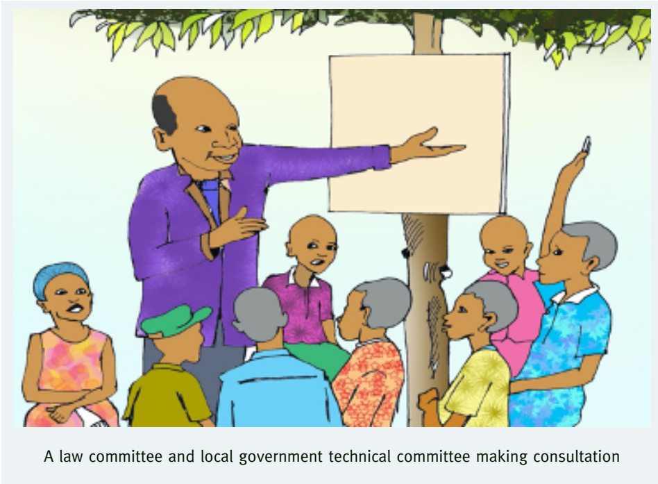
A law committee and local government technical committee making consultation