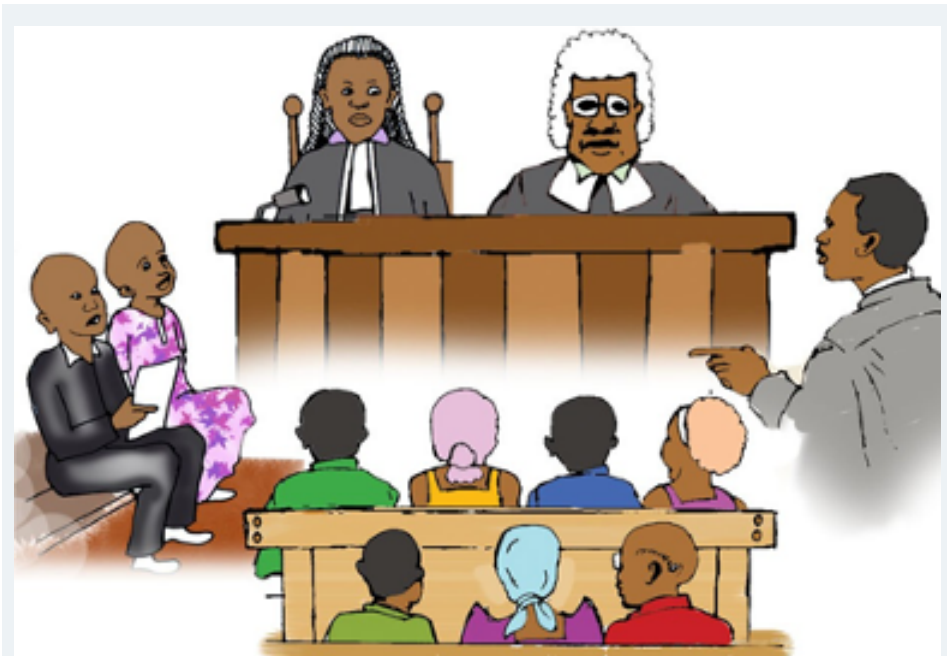
Council in session debating the bill