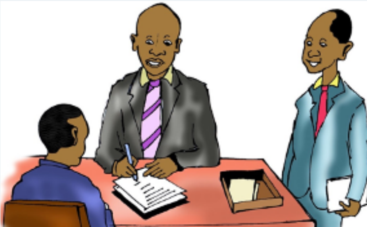
The Chairperson signing copies of the bill