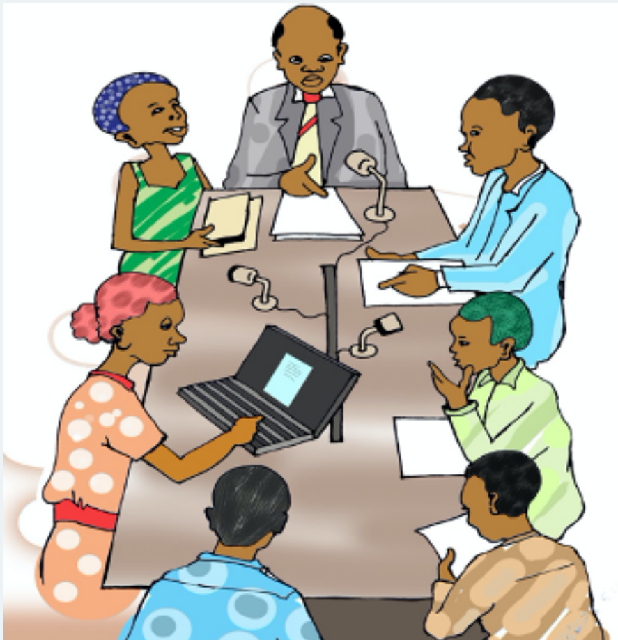
A Law Committee and local government technical committee drafting the law