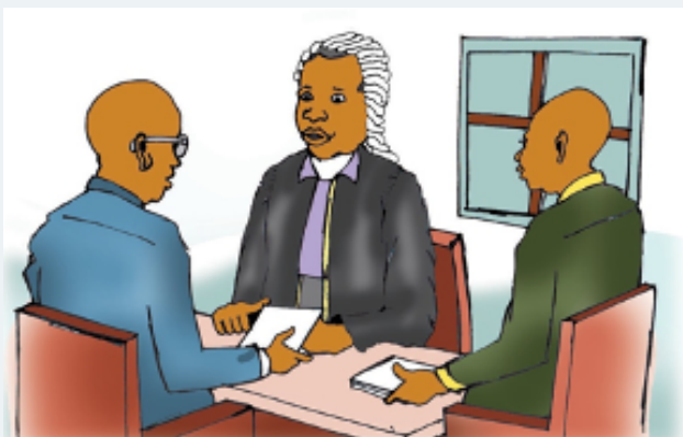
The Attorney General certifying the Bill